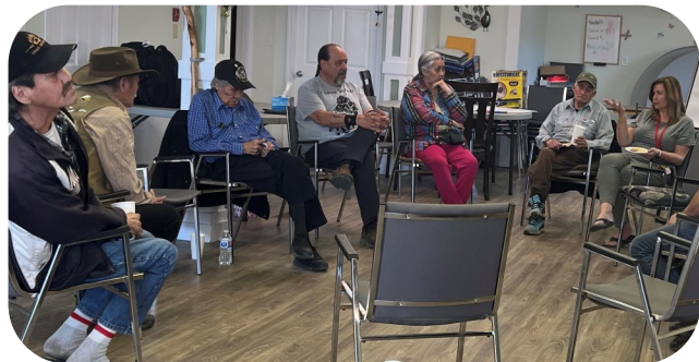
Elders in the workshop circle “Moving beyond the history of Residential School”