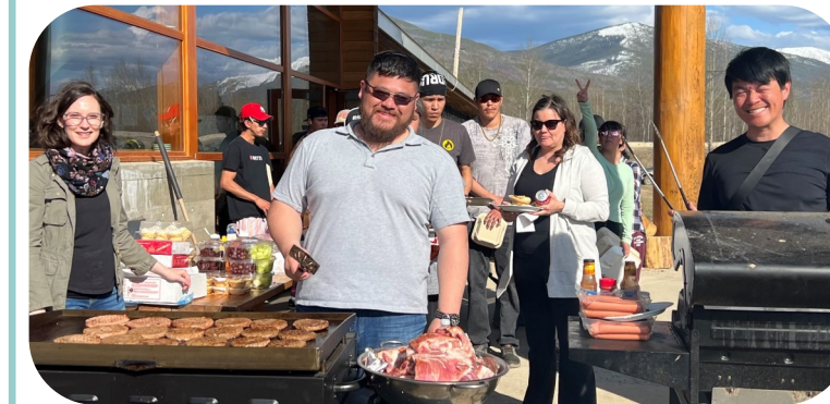
RCMP BBQ in our community May 4, 2023