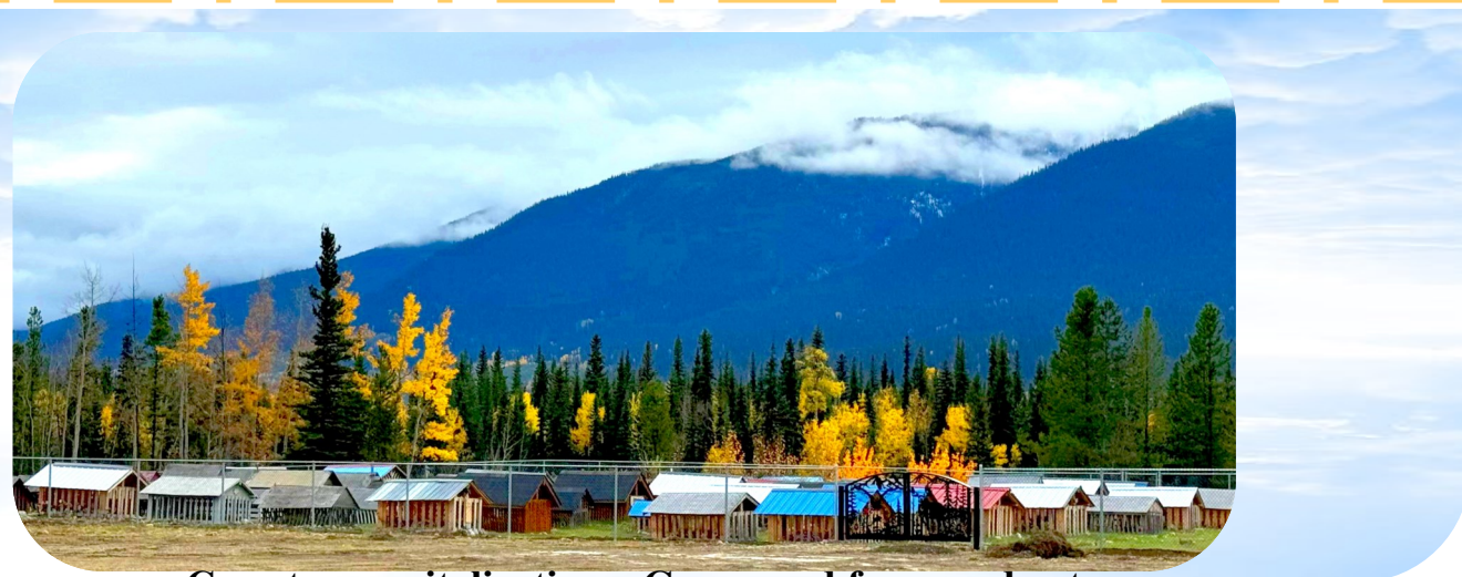
Cemetery revitalization—Graveyard fence and gates